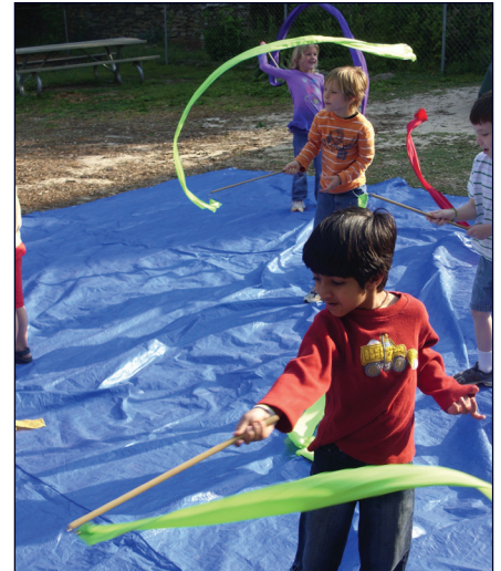
Primary students learn Chinese ribbon dancing. Weekly music classes were a popular activity for Primary and Elementary students alike.

In January 2011, KMS received a $600 grant from the Knox County Health Department to strengthen our ongoing work on fitness and nutrition with our students and families. We used these funds to purchase yoga mats and exercise equipment for our Primary classes and to buy family fitness guides and cookbooks with healthy, child-friendly recipes to loan to our parents.