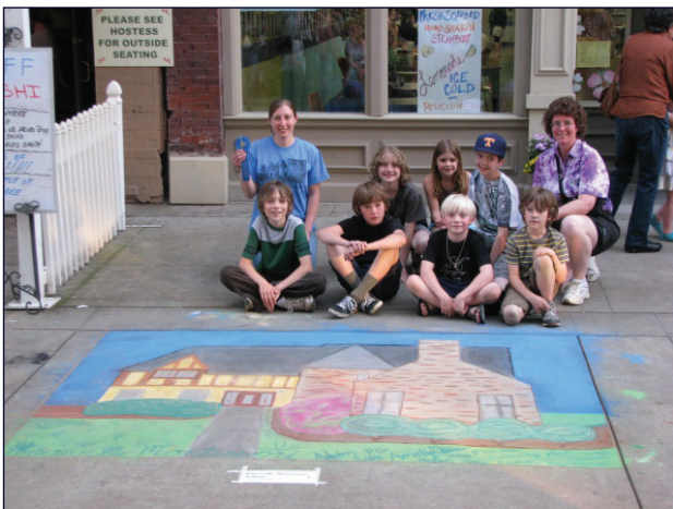
In April 2011, KMS Elementary students won first place in their division in the Dogwood Arts Festival Chalk Walk Competition. The class voted to give the prize money to Casa de Sara, a Montessori school serving poor children in Bolivia.

Building Repairs and Upgrades: We made a number of critical repairs and upgrades to our historic 84-year-old building, including installing a water filter in the kitchen, repairing flashing on the roof, making structural repairs to one of the walls, and addressing drainage issues on the playground and in the basement. At the same time, parents and staff on our Building and Grounds Committee developed a plan to upgrade our Primary classrooms, improve accessibility and traffic flow within the building, and make the building more energy efficient.